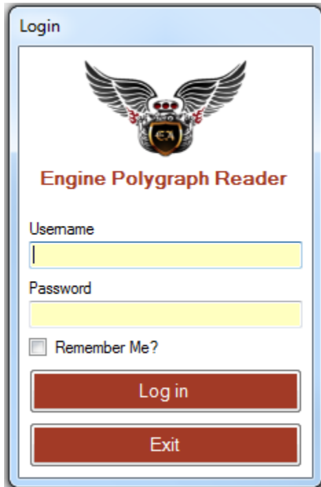
Figure 3 (Left): Panel displayed to initiate your session on your device.

The Install Wizard will place an icon on your PC desktop. Double-click on the icon to open the Login screen: